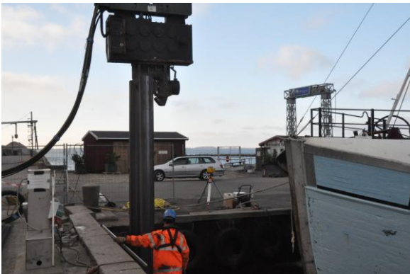
First sheet pile being positioned .

The new South Pier is expected completed on May 20 th 2016.